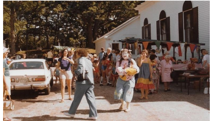
BWC Street Fair, c. 1983

Years ago, the BHS was given many items from the Bradford Women's Club. The Bradford Women's Club (BWC) was a very important organization in our town for many years. When reviewing some items, I found many "Programs" for events. The Women's Club sold these Programs for 10 cents at their street fairs and Annual Fairs to all that attended. In one of the Annual Fair Programs of August 8, 1945, was an article called "BRIEF HISTORY OF BRADFORD, N.H" which follows: