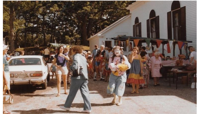
BWC Street Fair, c. 1983

Years ago, the BHS was given many items from the Bradford Women's Club. The Bradford Women's Club (BWC) was a very important organization in our town for many years. When reviewing some items, I found many "Programs" for events. The Women's Club sold these Programs for 10 cents at their street fairs and Annual Fairs to all that attended. In one of the Annual Fair Programs of August 8, 1945, was an article called "BRIEF HISTORY OF BRADFORD, N.H" which follows: